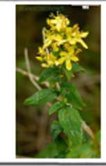
St John's wort