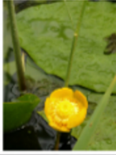
Yellow water lily